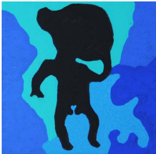
Mai Nguyen-Long De/coupling shape 2 Mixed media Various sizes 2010