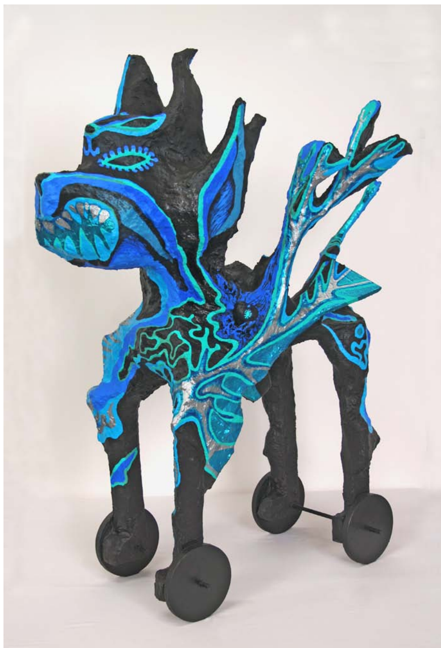
Mai Nguyen-Long Large grottoed dog on wheeled tray with bottle carcass, Large wheeled dog with teeming shoulder soldier conglomeration Mixed media Various sizes 2010