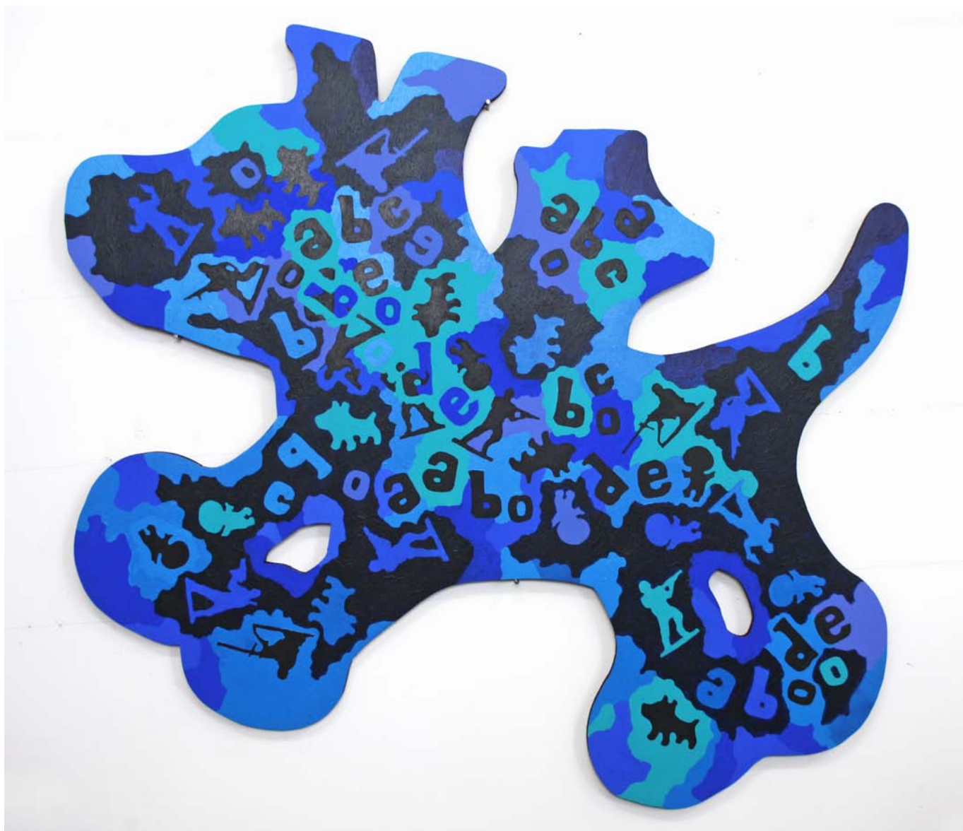
three little queen street chippendale nsw 2008 tel 9318 2992 ng@ngart.com.au www.ngart.com.au ng art gallery tue — sat 11am — 10pm mission tue — fri 11am — 10pm sat 9am — 10pm