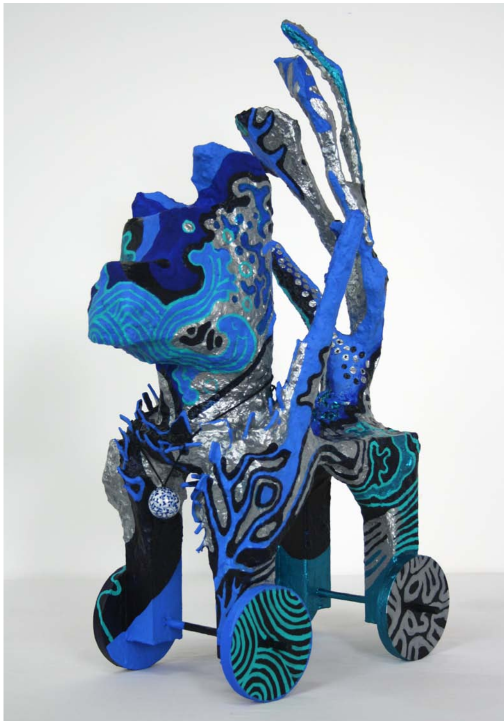
Mai Nguyen-Long Black dog with morph wings atop circus block, Small dog with belly shards & morph wings atop blue/black block, Wheeled flat top dog with branched tail & morph wings Mixed media Various sizes 2010