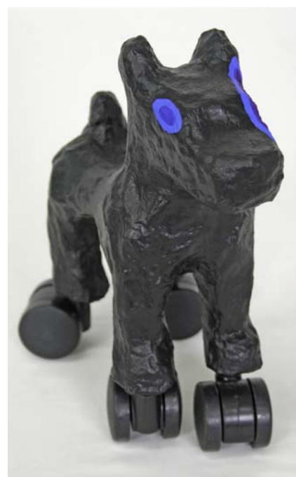
Mai Nguyen-Long Wheeled black dog with morph wings & belly shards, Small dog on castor wheels Mixed media Various sizes 2010