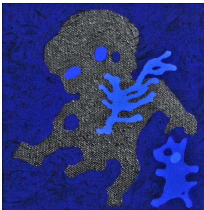
Mai Nguyen-Long De/coupling shape 4, De/coupling shape 5 Mixed media Various sizes 2010