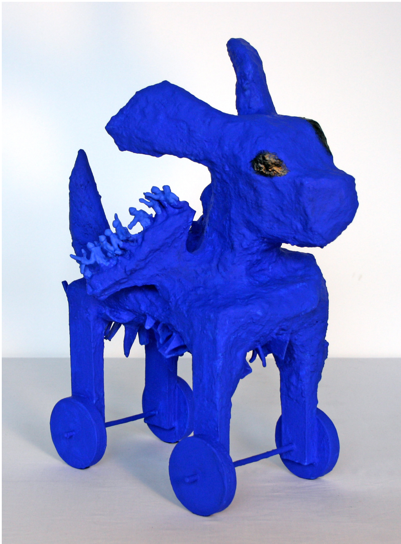
Mai Nguyen-Long Wheeled blue dog with morph wings and belly shards Mixed media Various sizes 2010

three little queen street chippendale nsw 2008 tel 9318 2992 ng@ngart.com.au www.ngart.com.au ng art gallery tue — sat 11am — 10pm mission tue — fri 11am — 10pm sat 9am — 10pm