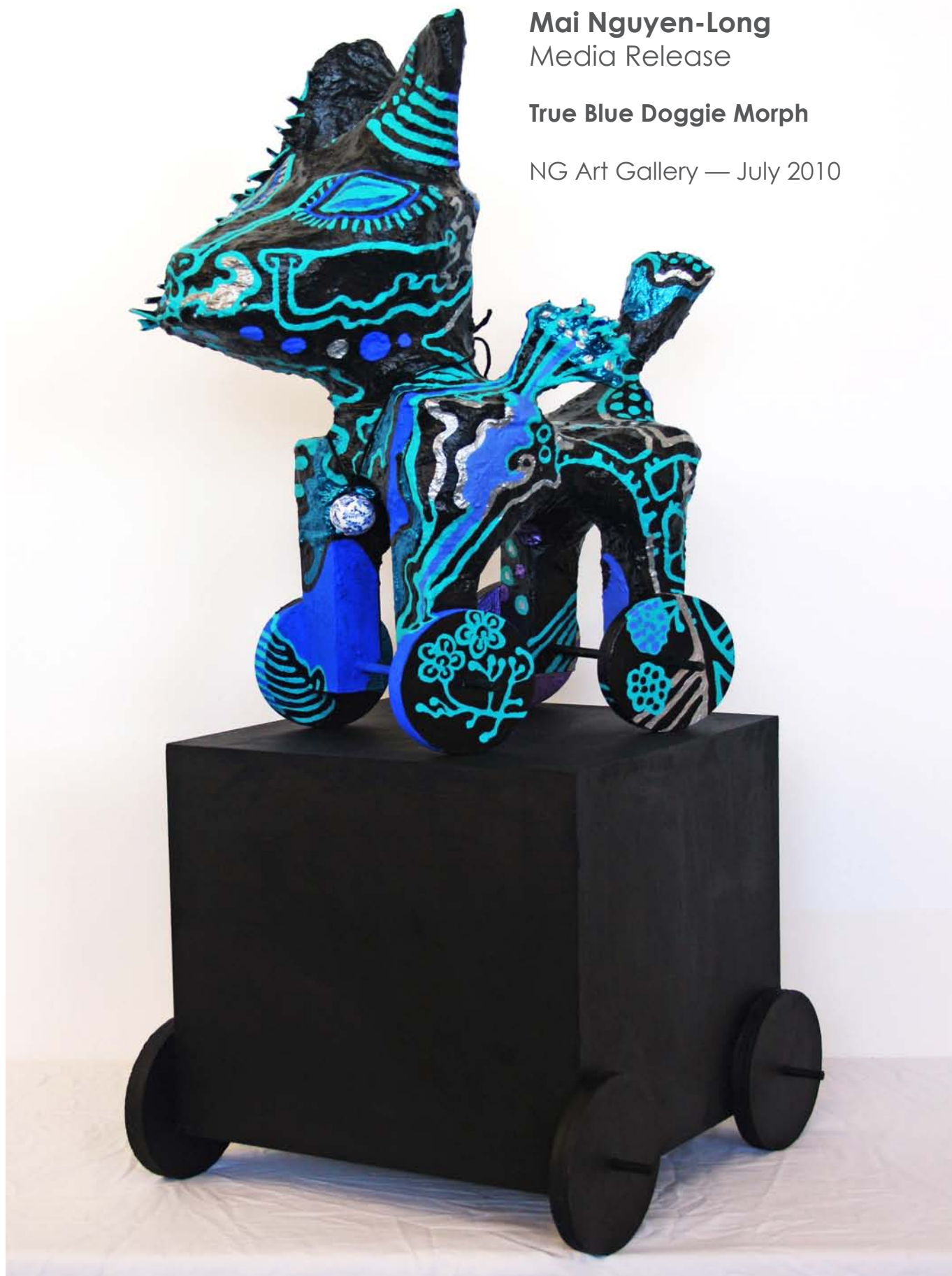
Mai Nguyen-Long Wheeled dog on wheeled black block Variable 45cm x 113cm x 45cm 2010

three little queen street chippendale nsw 2008 tel 9318 2992 ng@ngart.com.au www.ngart.com.au ng art gallery tue — sat 11am — 10pm mission tue — fri 11am — 10pm sat 9am — 10pm