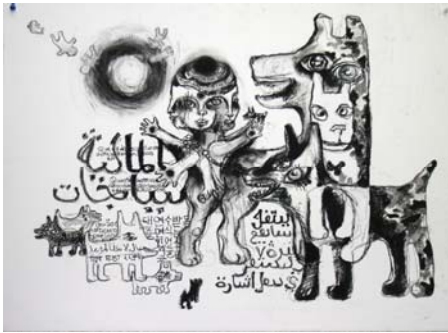
43. H Drawing 2 Charcoal on Stonehenge 57 h x 77 w cm 2008