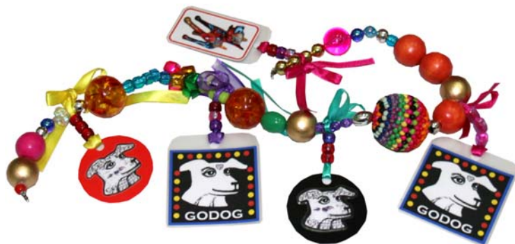
IMAGE: Images and Pendants worn by Godog and the VC Aqua Mutts , detail: Godog & the Ascension of Dag Girl