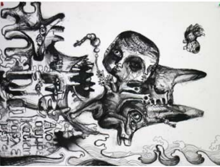
49. H Drawing 8 Charcoal on Stonehenge 57 h x 77 w cm 2008