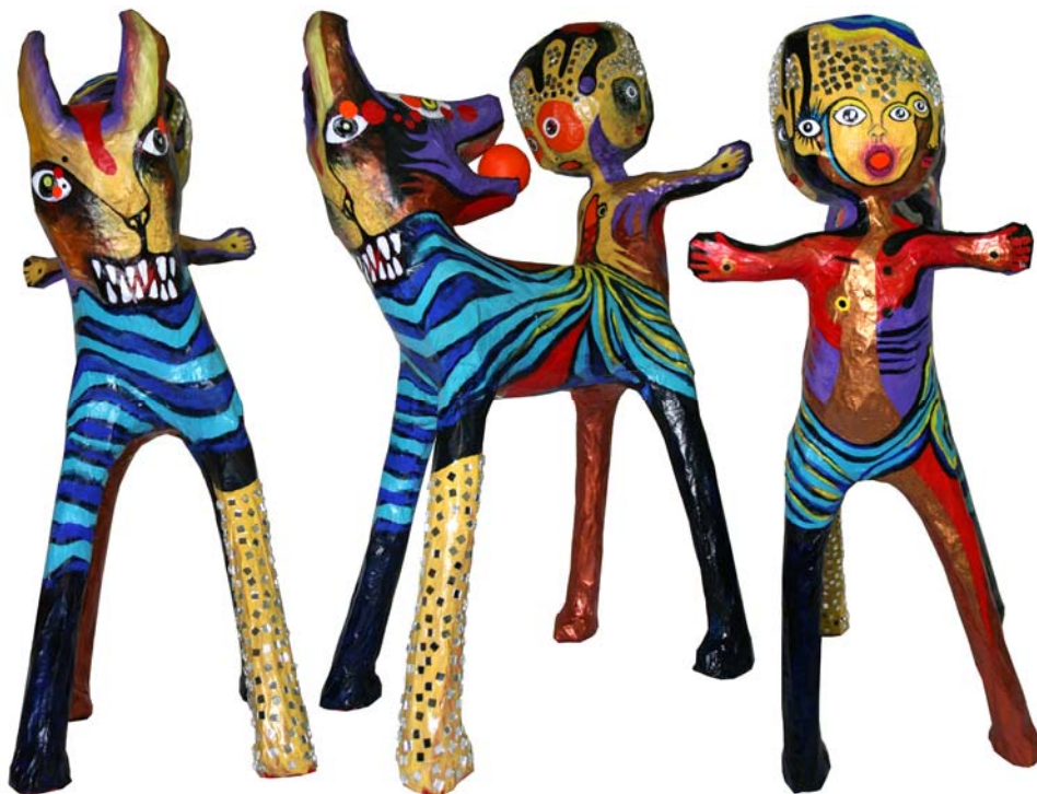
IMAGE: The Offering (three views of the object), detail: Godog & the Ascension of Dag Girl

Perhaps the exhibition's title offers a clue with its oblique reference to Samuel Beckett's 1948 play "Waiting for Godot", the story of two men waiting for another, perhaps God, who never arrives. It is a hint to Long's wry questioning of the absence of meaning within contemporary society and our compulsion to construct value systems aimed at "enlightening us". It is not the arrival of the mysterious Godot that was the revelation, rather the wait itself. Similarly, Long's interest in an acceptance of non-understanding is central to this exhibition.