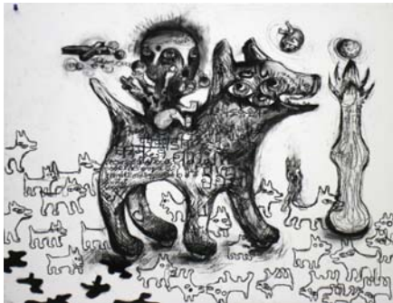
48. H Drawing 7 Charcoal on Stonehenge 57 h x 77 w cm 2008