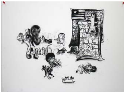
45. H Drawing 4 Charcoal on Stonehenge 57 h x 77 w cm 2008