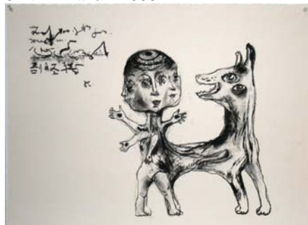
47. H Drawing 6 Charcoal on Stonehenge 57 h x 77 w cm 2008