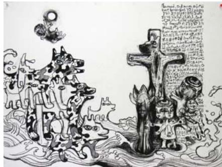
44. H Drawing 3 Charcoal on Stonehenge 57 h x 77 w cm 2008