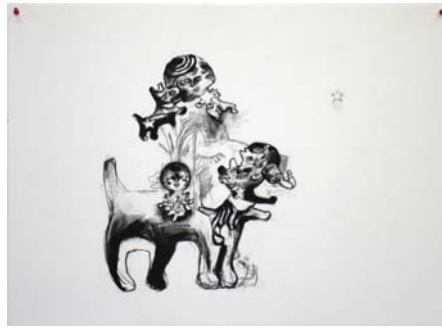
50. H Drawing 9 Charcoal on Stonehenge 57 h x 77 w cm 2008