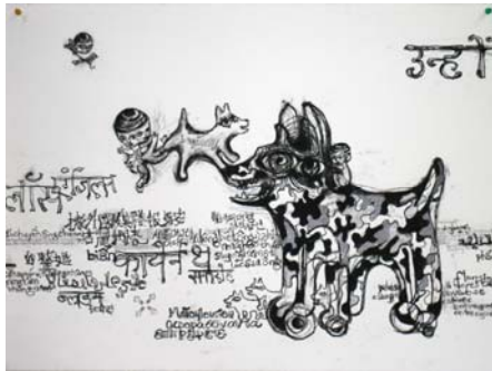
42. H Drawing 1 Charcoal on Stonehenge 57 h x 77 w cm 2008