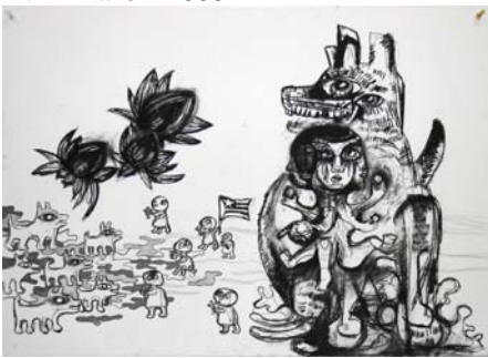
46. H Drawing 5 Charcoal on Stonehenge 57 h x 77 w cm 2008