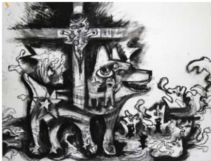
51. H Drawing 10 Charcoal on Stonehenge 57 h x 77 w cm 2008