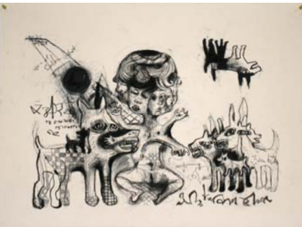
52. H Drawing 11 Charcoal on Stonehenge 57 h x 77 w cm 2008