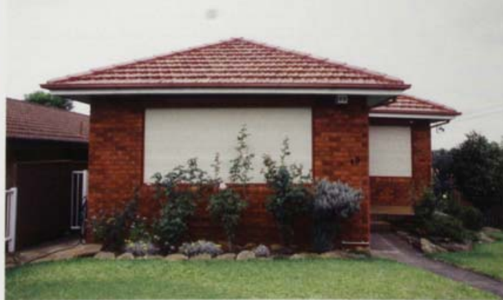
Figure 8. Garry Trinh, Welcome Home (2007), House 2 (series of 20).

Garry Trinh is another artist who is concerned more about Australia's contemporary social issues than identification of and with his ethnic group. Welcome Home (2007) (fig. 8) is a series of twenty photographs of various houses with closed shutters. In these photographs 'Home, Sweet Home' has become