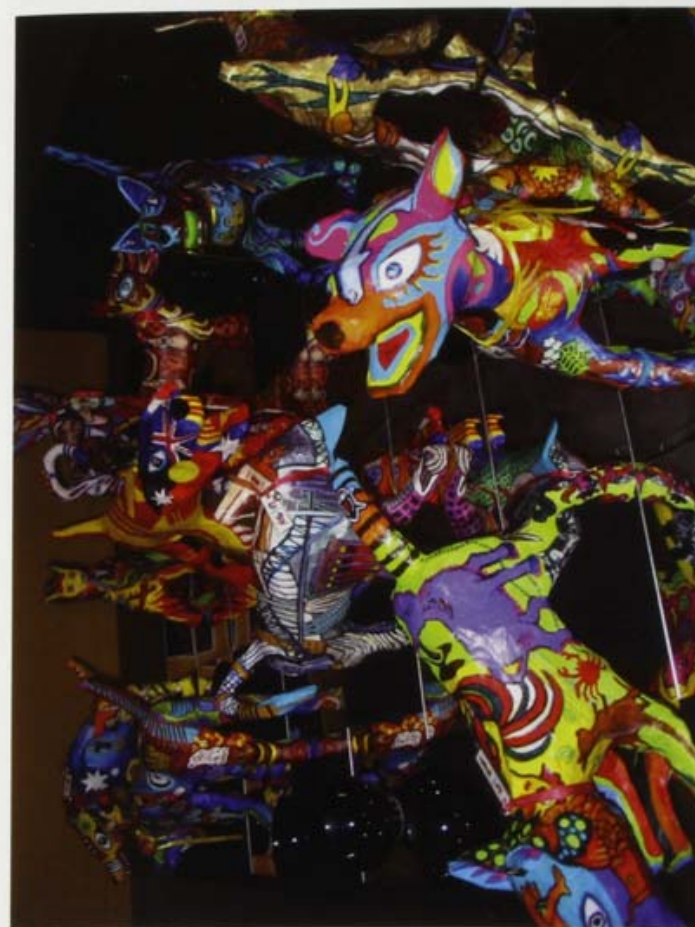
Figure 4. Mai Nguyen-Long, Pho Dog Installation .

broadcast due to the fact that Thời Sự generated a 'community hurt' even to those who only heard about it. 6 On the 2nd November 2005, more than ten thousand Vietnamese demonstrated in front of Sydney Town Hall, against a touring music show from Vietnam entitled Duyên Dáng Việt Nam (Charming Vietnam