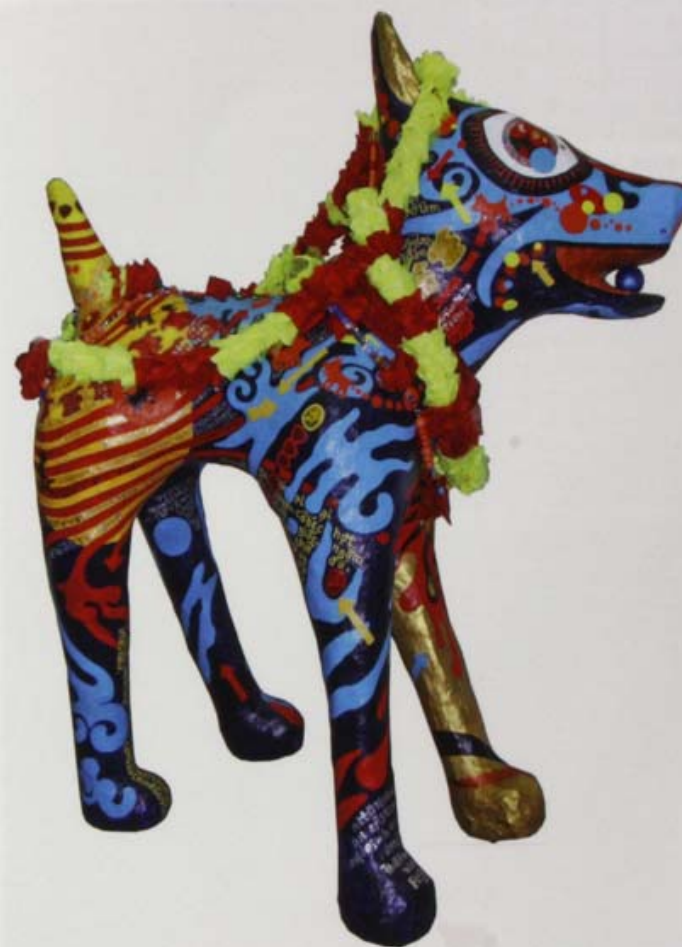
Figure 5. Mai Nguyen-Long, Godog (2009), papier mâché (avian mesh frame) 190 x 157 x 82 cm.

The issue became more heated when it was reported on Australian Broadcasting Commission's Television program Lateline , and a representative of