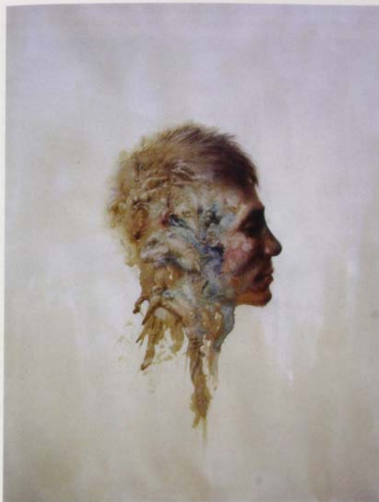
Figure 10. Khue Nguyen, Unleashed (2009), watercolour and pencil on paper, 100 x 75 cm.

Fly Me To The Moon (2010) (fig. 11) presents a muscular male torso seen from the back, positioned as if about to fly, and Never Felt This Way (2010) portrays only the back of a man. However, both strongly express human emotions and vulnerability and belong to a new series titled In Search of Sensuality , which