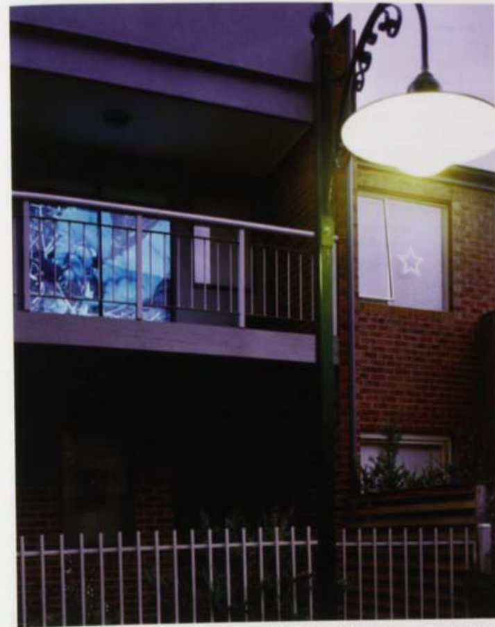
Figure 7. Hoang-Tran Nguyen, Location Migration 2 (2005) Site 2.

installation, Local Migration 2 , was also included in the 2005 Big West Festival in Melbourne, an event that emphasised the 'home' of a displaced home. 14 Hoang was allocated three vacant properties provided by a real estate agency, to project the three components of his installation. The sound artist, Roger Alsop, created a soundscape for all three sites. Site 1 (fig. 6) was a vacant shop front where Hoang projected footage of the immense Pacific Ocean, taken on his way to Bidong Island. The mesmerising projection of rolling water on the huge shop window